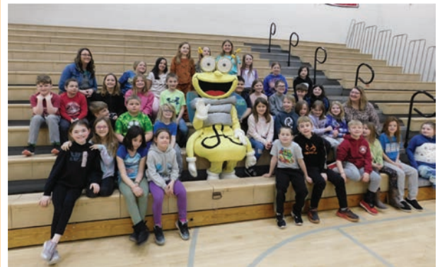
Louie the Lightning Bug is pictured above with the second and third grade students from HLV.