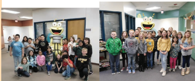
Pictured above are 2nd and 3rd grade students from South Tama Elementary School.